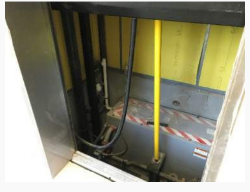
MEP Rough at Elevator Pit