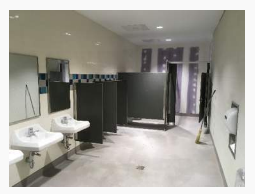
Bathroom Accessories & Fixtures