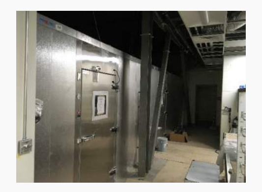
Freezer & Cooler at Kitchen