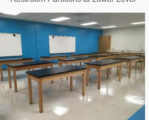
Desks in Science Classroom