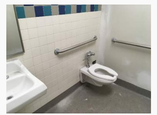
Fixtures in Single Restroom at Lower Level