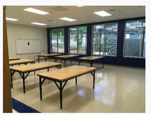
Desks in Art Classroom at Renovation