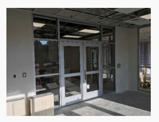
Storefront at Entrance Vestibule