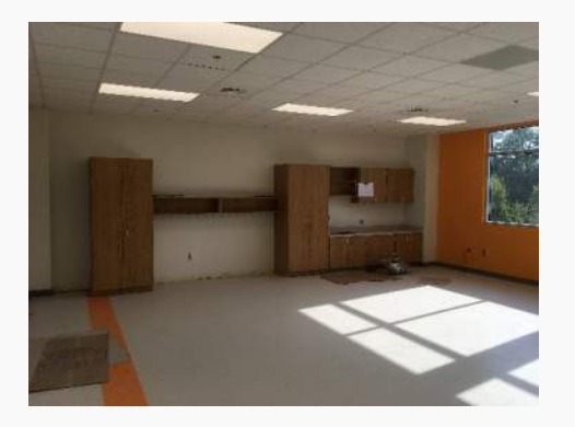
Millwork at Classrooms