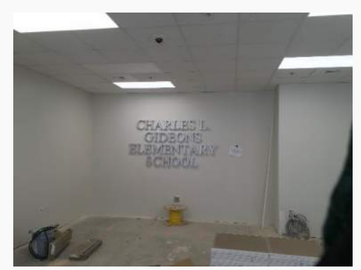
Signage at Front Lobby