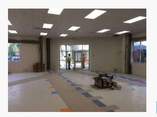
VCT Flooring at Kitchen