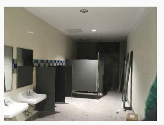
Restroom Partitions at Lower Level